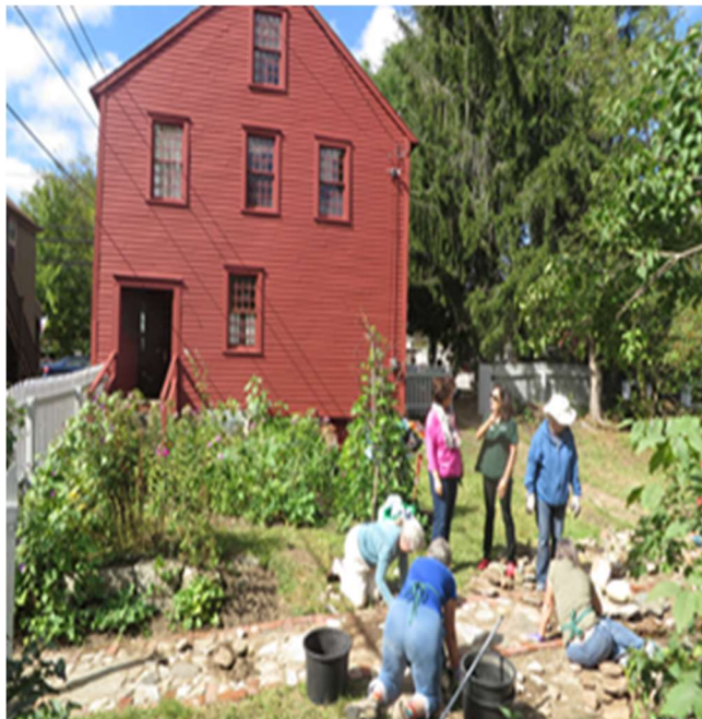
URI Master Gardeners hard at work